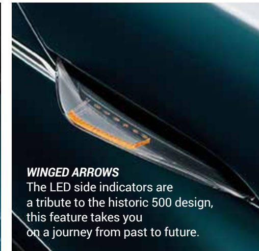
WINGED ARROWS The LED side indicators are a tribute to the historic 500 design, this feature takes you on a journey from past to future.