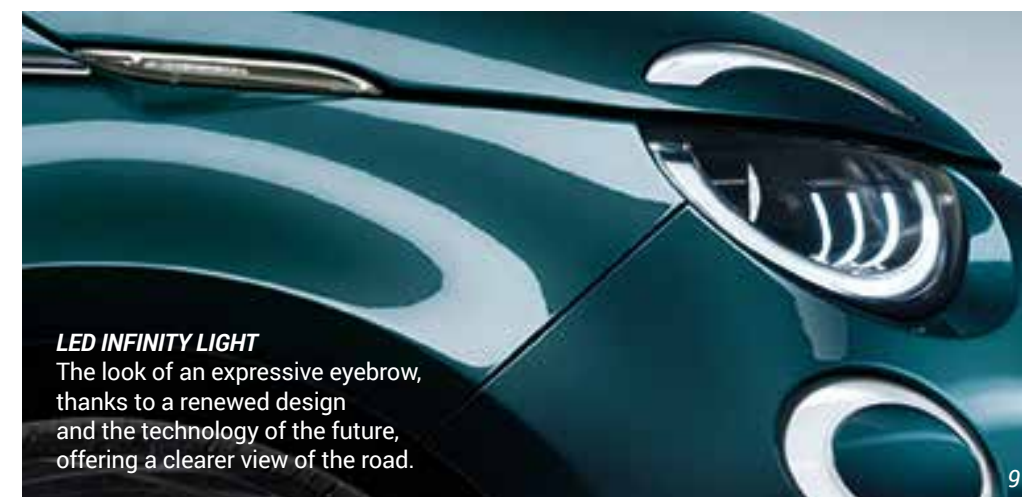
LED INFINITY LIGHT The look of an expressive eyebrow, thanks to a renewed design and the technology of the future, offering a clearer view of the road.