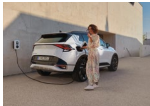
Quick charging Recharge your Sportage PHEV with its 7.2kW on-board charger. Electric range up to 70km.