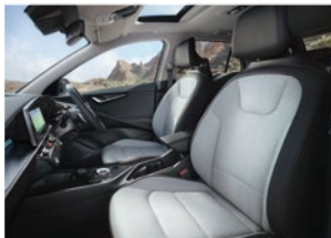
Interior Premium effect recycled cabin materials reduce the Niro's carbon footprint.