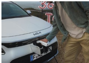
Vehicle-2-Load (V2L) Technology that allows you to charge and power your devices on the go.

The Kia Niro offers you a choice between Hybrid, Plug-In Hybrid, and Full Electric technology. The Niro EV offers a driving range of up to 460km from a single charge, while the Plug-In Hybrid version provides a full electric range of up to 65km and an ultra efficient combined fuel economy from just 1 litre per 100km. This latest model Niro is more practical than ever before thanks to its larger dimensions for increased space and practicality, it also features a host of standard safety features that have earned it the maximum five-star Euro NCAP rating.