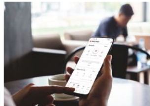
Remote Heating Start or schedule the heating of your EV or PHEV from your smartphone.