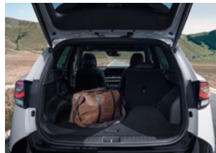
Practicality Enjoy large boot space of up to 591 litres.