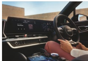
12.3" instrument cluster For easily adjustable vehicle controls (available on K3 models and above).

Stylish and sophisticated, the Sportage is one of Ireland's favourite SUVs. With multiple powertrains to choose from including Diesel, Mild-Hybrid, Hybrid and Plug-In Hybrid, the Sportage is low on emissions and big on choice. With over 30,000 Sportage models sold since its arrival in Ireland and now on our 5th generation; this year we're celebrating 30 Years of Kia Sportage and to mark the occasion we're delighted to announce the introduction of 'Anniversary Edition' Sportage available in both hybrid and plug-in hybrid electric.