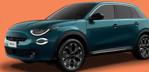
Green - Sea