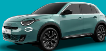
Blue - Sky