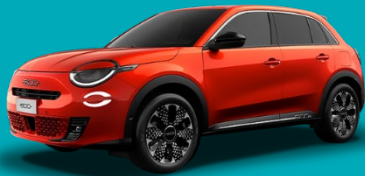
Orange - Sun