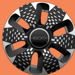
Standard Wheel 18" Alloy Wheels Diamond Cut