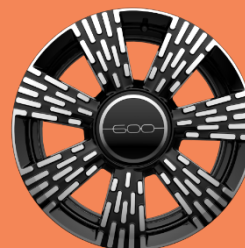
Standard Wheel 17" Alloy Wheels Diamond Cut