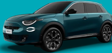
Green - Sea