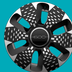
La Prima Standard Wheel 18" Alloy Wheels Diamond Cut