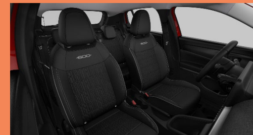
Standard Upholstery Black Recycled Fabric Seat Upholstery with Fiat Monogram