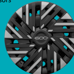
(RED) Standard Wheel 16" Steel Wheels with Covers