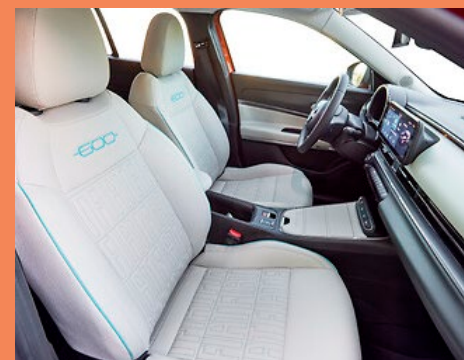
Standard Upholstery Full Ivory Fiat Monogram Leather Seat Upholstery

All pictures for illustration purposes only