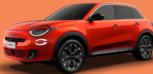
Orange - Sun