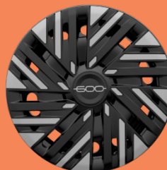
Standard Wheel 16" Steel Wheels with Covers