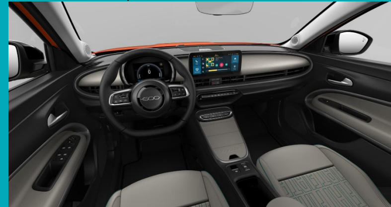
Sand – Earth