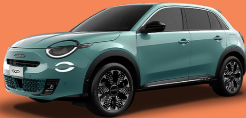
Blue - Sky