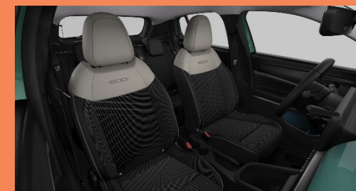
Black & Ivory Recycled Fabric Seat Upholstery with Fiat Monogram