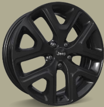
Summit Standard Wheel 18" Alloy Wheels