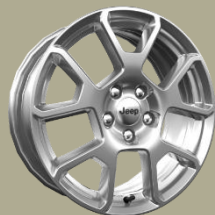
Altitude Standard Wheel